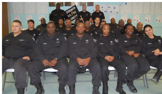
Left: CERT graduated from the POST certified training Nov. 11, making them an elite squad.